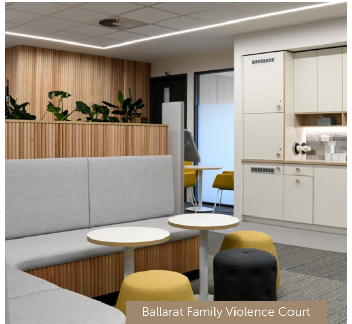
Ballarat Family Violence Court