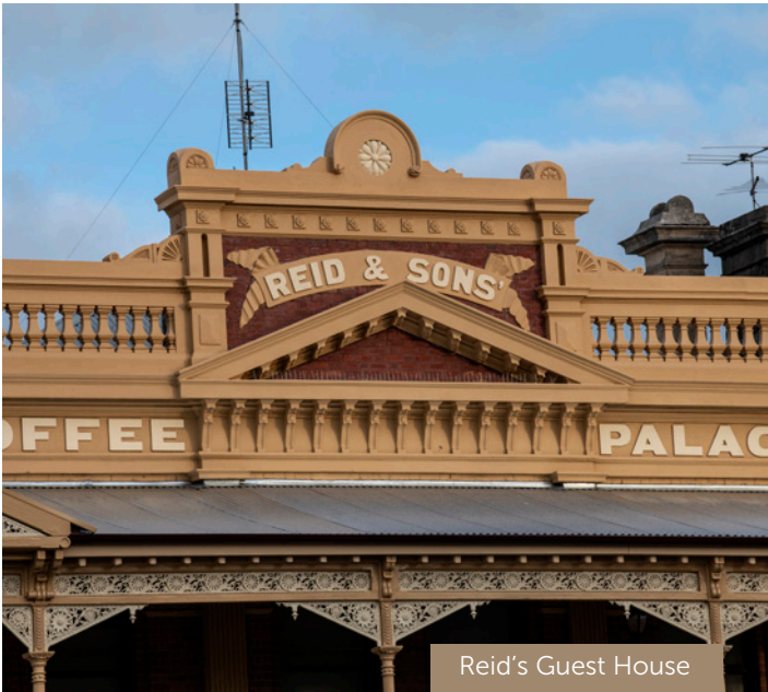
Reid's Guest House