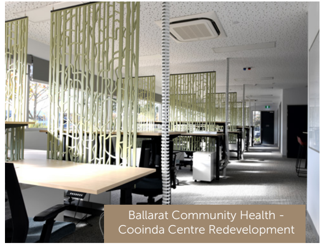
Ballarat Community Health - Cooinda Centre Redevelopment