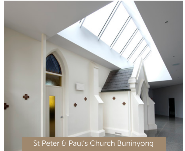
St Peter & Paul's Church Buninyong