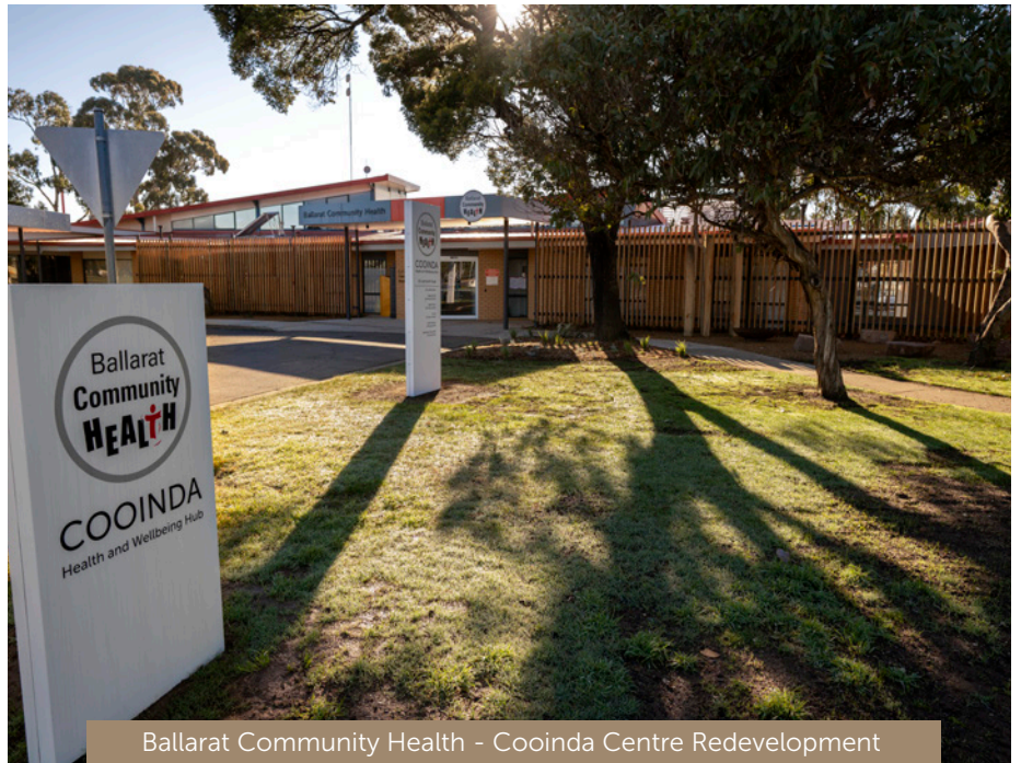
Ballarat Community Health - Cooina Centre Redevelopment