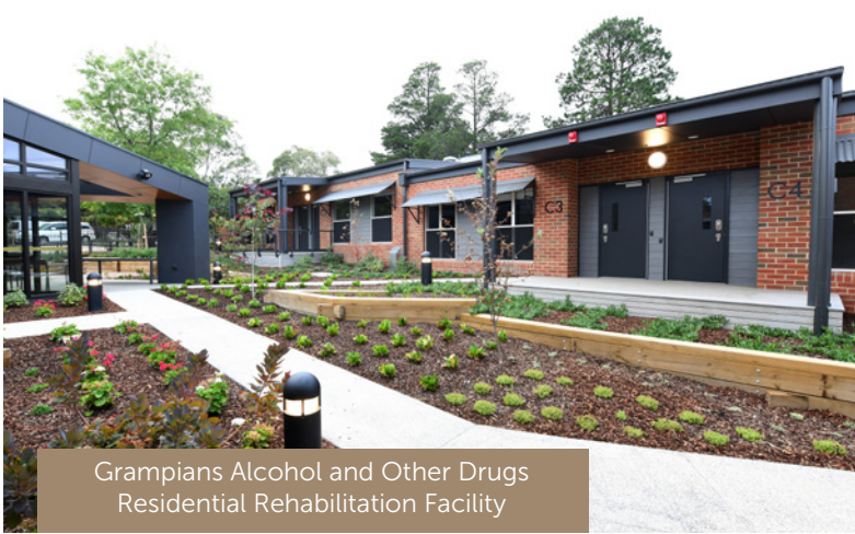
Grampians Alcohol and Other Drugs Residential Rehabilitation Facility