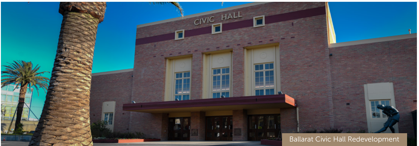
Ballarat Civic Hall Redevelopment