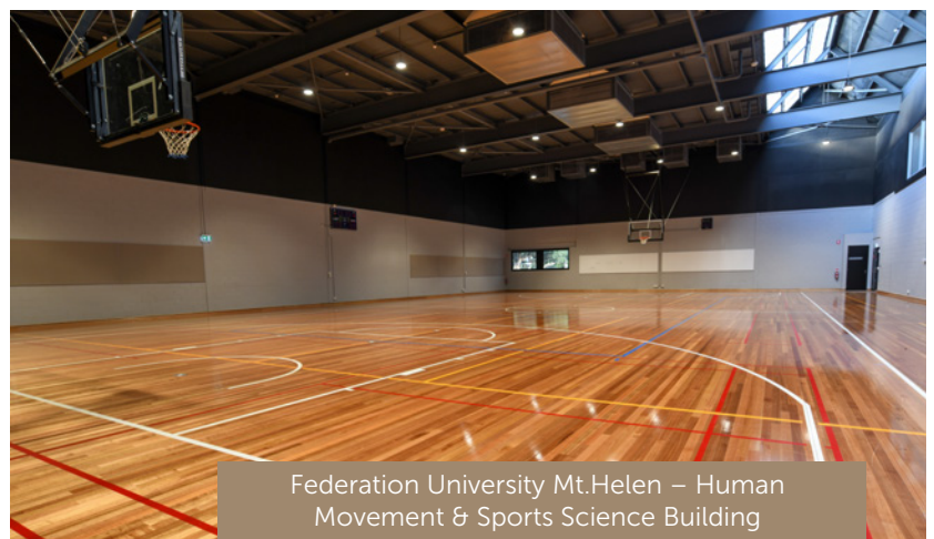
Federation University Mt.Helen – Human Movement & Sports Science Building