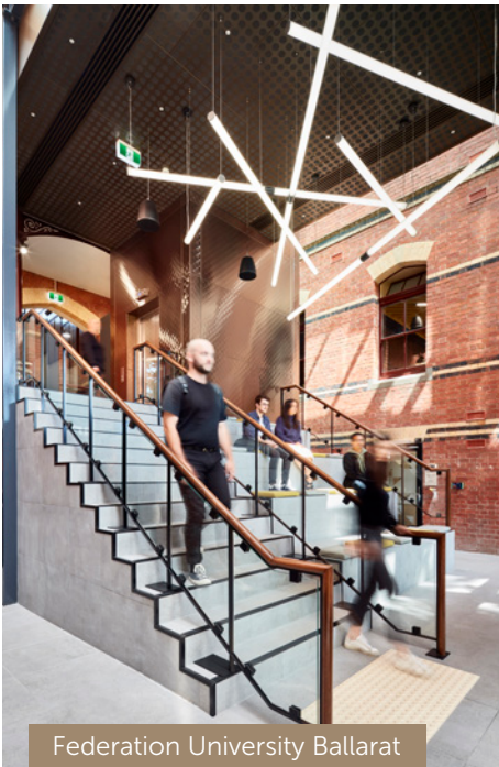
Federation University Ballarat