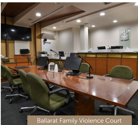
Ballarat Family Violence Court