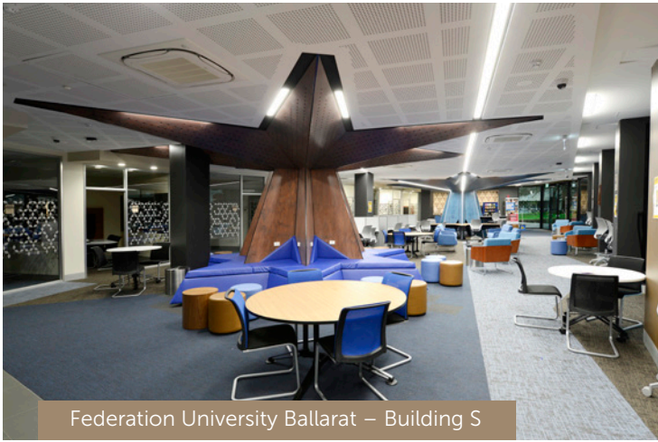
Federation University Ballarat – Building S