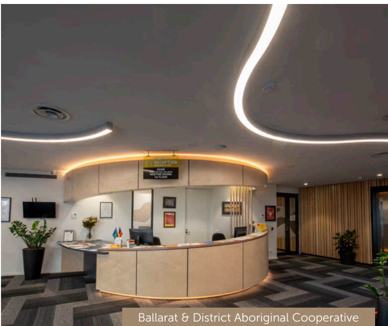
Ballarat & District Aboriginal Cooperative